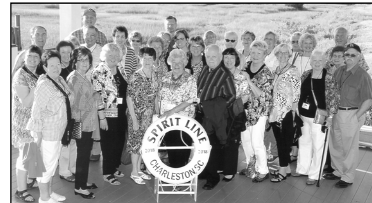
Charleston & Beyond! St. Matthew Senior Travels